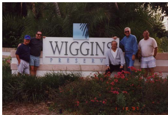
Quite an entrance sign!