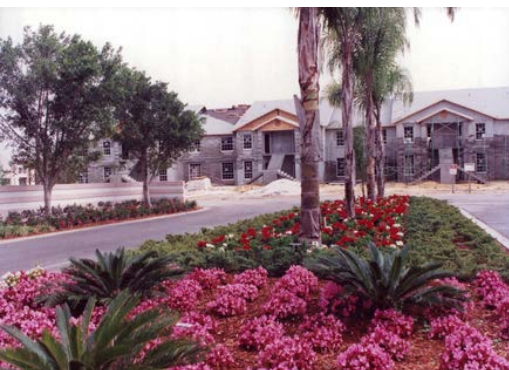
Our beautiful entrance!