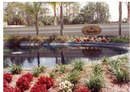
Lovely, but where was it?