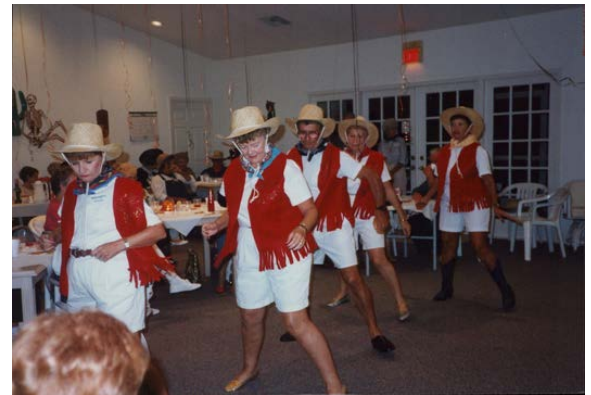
How about some Wiggins Line Dancing???