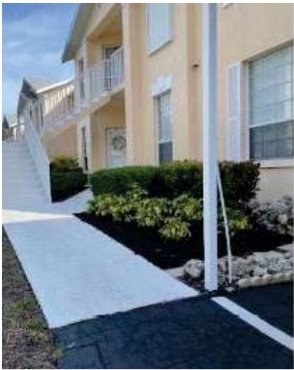
790 Some front work

The following pictures provide highlights from the past three weeks: