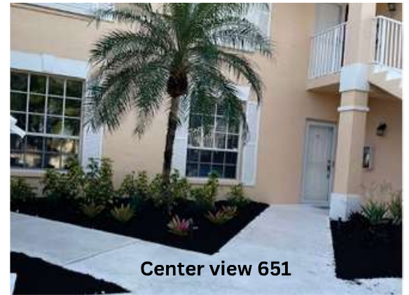
Center view 651