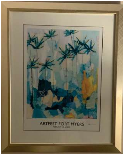
Commerative poster from our first ArtFest in 2022

ArtFest Fort Myers, Sat & Sun, Feb 1-2 (Opening Night Fri, Jan 31)