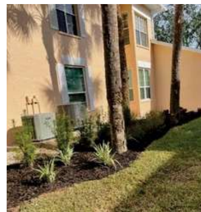
Building 665- Front and sides completed