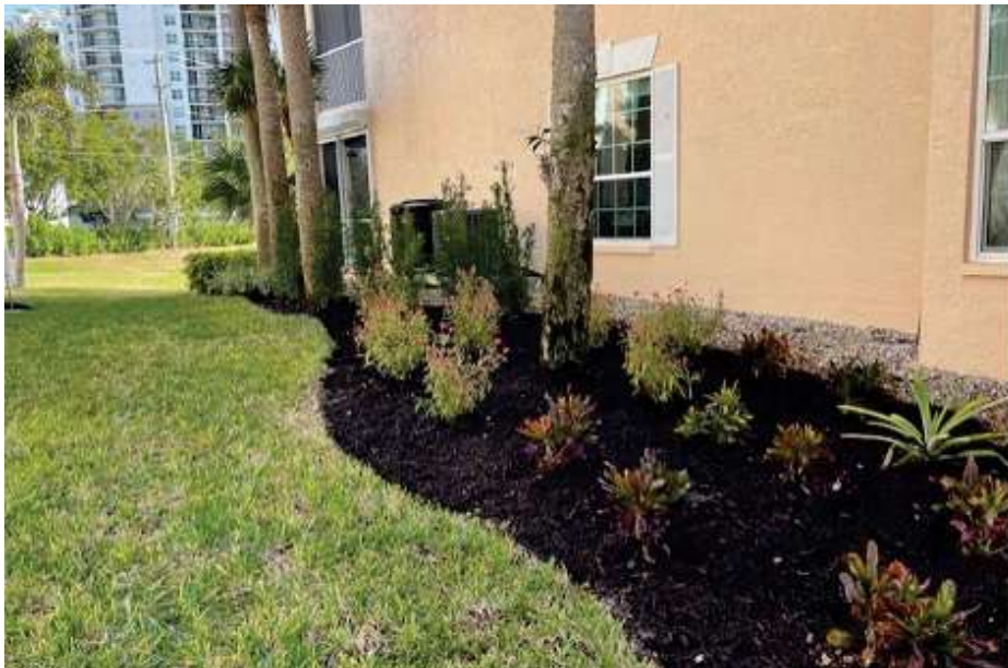
Right side with existing Scheffleras, 657