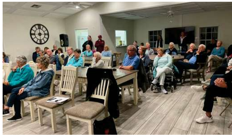
The Clubhouse was filled with interested owners.

Meet our Candidates in their own words, and what they shared would be the greatest strength they would bring to the Board: