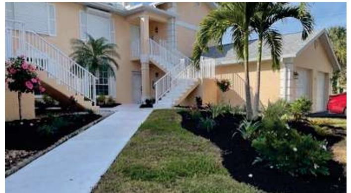
Left side views 651