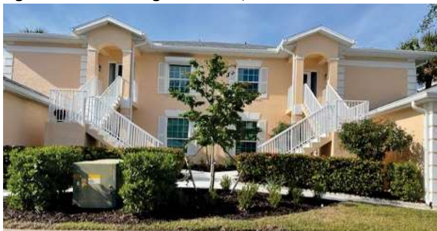
Front center and street view- Building 657