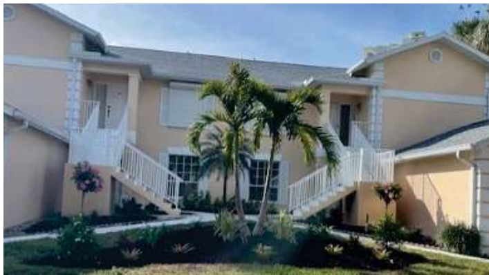
Building 651: Plantings in front put in to coordinate with the side which was completed under drainage work last month