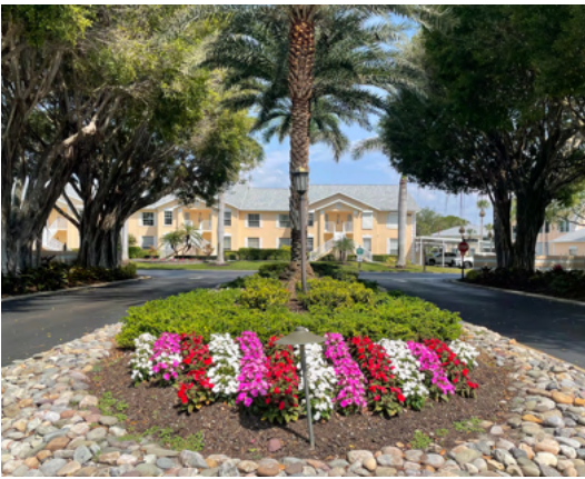
Our flowers are blooming!