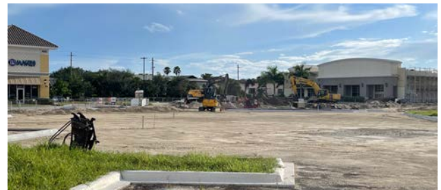
Publix update-Crews have been demolishing old buildings in the plaza to make room for the new Publix. You can see a big section of the old building is gone. Opening expected in May 2026.