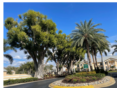
Our entrance is looking GREAT!

Payment must be by Feb. 14 because of the deadline for the food to be ordered and paid for. After dinner, for those who would like to stay and play, we will break into randomly assigned teams to play trivia. Many questions will have an Olympic theme or Italian theme. It'll be a fun night!