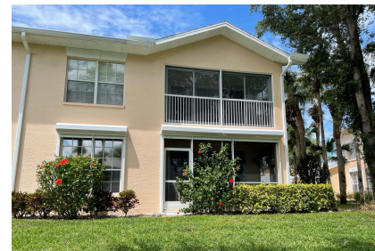
Some buildings are in good shape

WATCH FOR OUR SURVEY ON LANDSCAPING – WE WANT YOUR INPUT! As we discussed in the May Board meeting, the final phase of our landscaping recovery from the devastation of Hurricane Ian is restoring the landscaping behind our buildings. We have received a proposal from Leo Jr. to complete all remaining areas for approximately $100,000. We would like your input on how we fund and proceed with this project. Our partner, Get Quorum, will be sending out a survey we developed to every owner. The survey describes three options. It is very brief, but very important. We hope that you will take a moment to select only ONE option that you prefer and return the survey. The survey will be sent via email by Get Quorum; we will send an email blast as soon as it has been sent out. Your participation in this survey will help guide the Board’s course of action. We thank you!