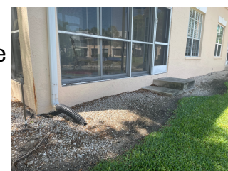
Other buildings look like this