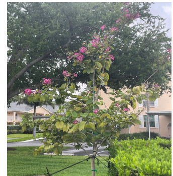
The orchid tree beside the front dumpster is also in full bloom – it looks beautiful!