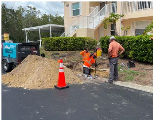
The connection to potable water is being completed by Collier County workers.

Many of you will start traveling back soon, so I wish you a safe journey and look forward to seeing you when you return.