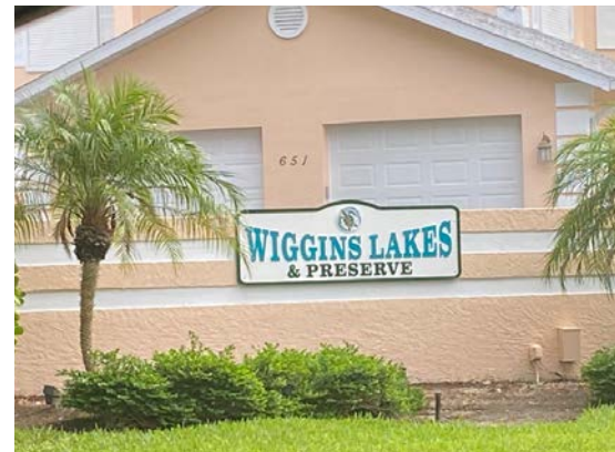
The new signs for our community have been completed and installed.