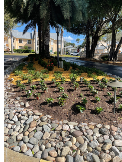
Planting has begun!

Mechanicals (AC units, dumpster enclosures, utility shutoffs); fencing along Gulf Harbor and Pan Am; trees; fronts of buildings; side and rear of all buildings. The next step will be to share design proposals with the community for feedback. Once final designs are selected, costs and funding can be determined. The target date for final design selection is mid-February for all priority areas.