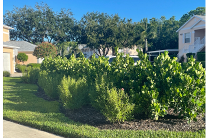
This is the corner of Wiggins Lake Drive and Court by 768 where we had to remove palms with the disease Ganoderma. The Clusia are getting higher and fuller!